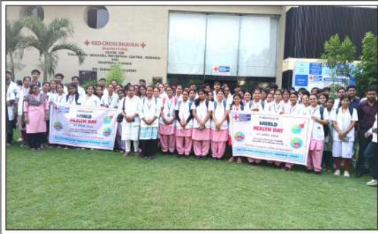
TRAINING MODULE AT INDIAN RED CROSS SOCIETY