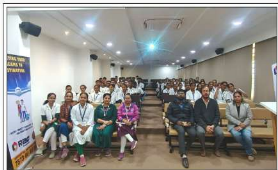
SEMINAR ON GLOBAL CAREER AT AINS COLLEGE