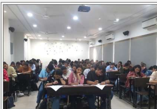
MPT PREPARATORY EXAM