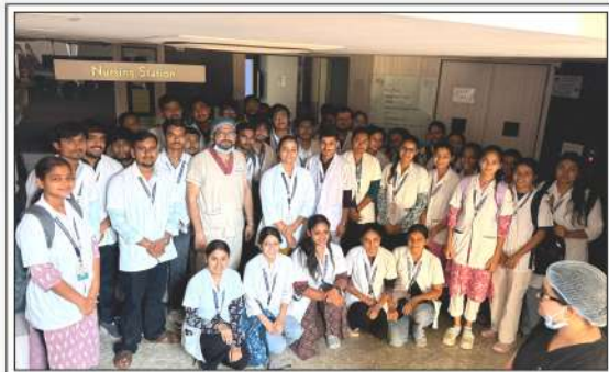
INFERTILITY VISIT AT SUMIRAN WOMEN'S HOSPITAL