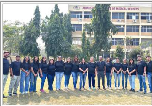
SPORTS DAY CELEBRATION