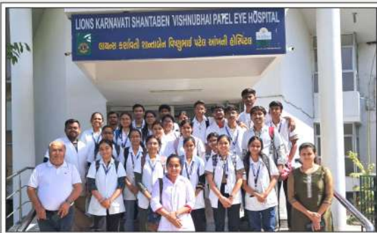
EDUCATIONAL VISIT AT LIONS KARNAVATI EYE HOSPITAL