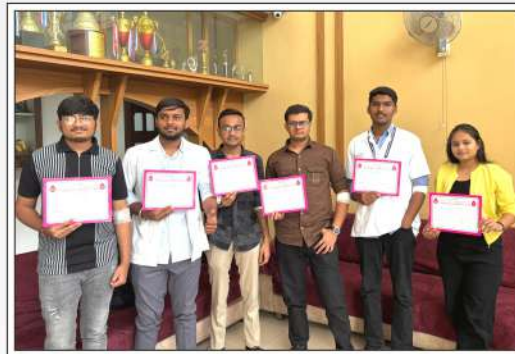
ORGANISED BLOOD DONATION CAMP