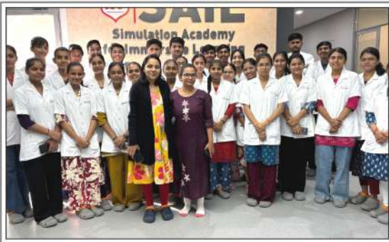
FIRST AID TRAINING MODULE AT K.D. HOSPITAL