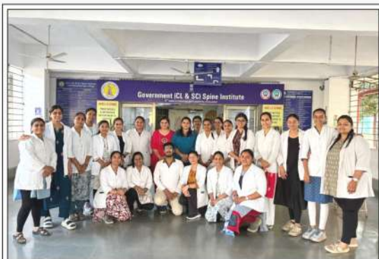
INSTITUTIONAL VISIT AT GOVERNMENT (CL & SC) SPINE Institute