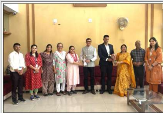
SEMINAR ON "ALL ABOUT ACL"