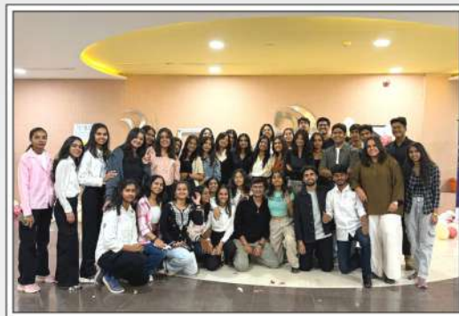
FRESHER'S PARTY 2026