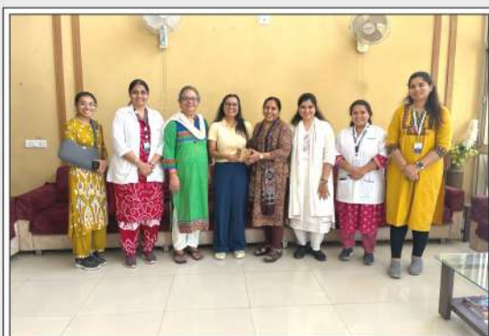
LECTURE ON VETERINARY PHYSIOTHERAPY