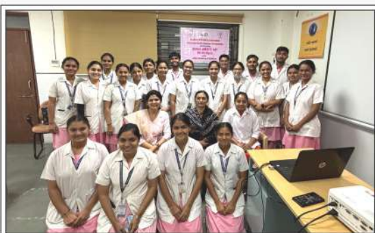
LECTURE ON WORLD OBESITY DAY AT SOLA CIVIL HOSPITAL