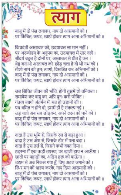
Sivam Kashyap Sem-6 - B.Sc. Nursing