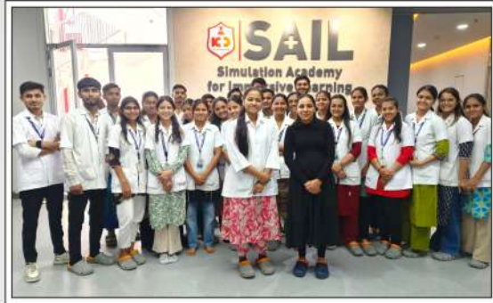
SKILL BIRTH ATTENDANCE TRAINING MODULE AT K.D. HOSPITAL