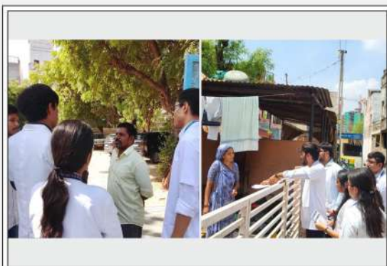
SCREENING AT LAPKAMAN VILLAGE