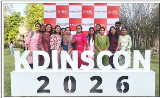
CONFERENCE AT VIBRANT GUJARAT EXHIBITION, GANDHINAGAR