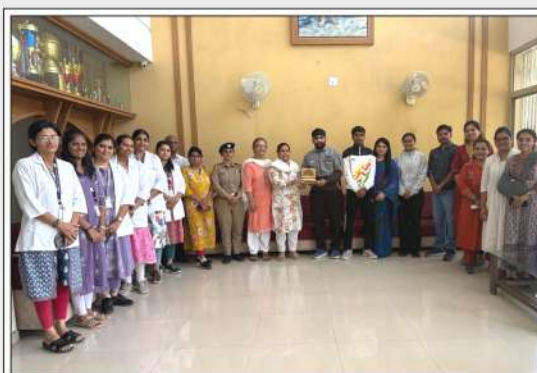
SELF DEFENSE WORK SHOP