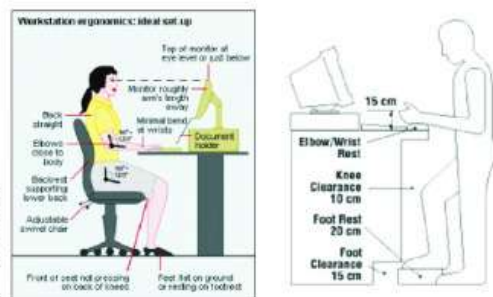
Figure 2: Ergonomics in sitting and standing positions

It is focused on Workplace Ergonomics and takes anatomical, anthropometric, physiological and biomechanical characteristics into consideration like body manipulations, carrying heavy weights, movements (especially repetitive ones). It is an approach or solution to deal with a number of work-related musculoskeletal disorder.