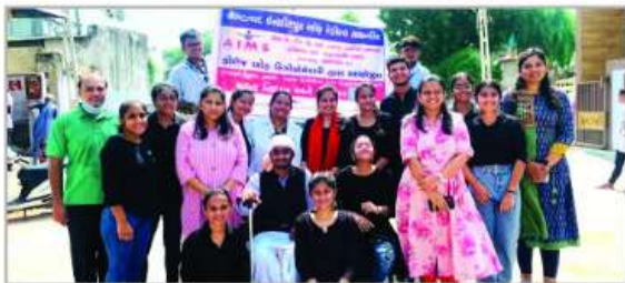
Medical Camp at Lapkaman Village