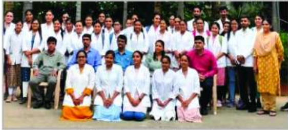
Educational Visit at National Institute of Occupational Health, Meghaninagar, Ahmedabad