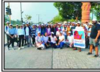
BPT & MPT Students Participated at Global Diabetic Walk