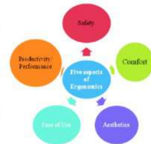
Figure 1: Aspects of Ergonomics

It is a discipline that studies the relationship between the activity or work performed by human and the components of this work includes tasks, tools, methods, work environment, etc.