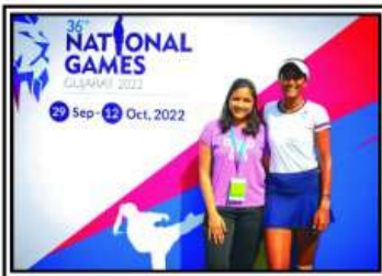
MPT Students Participated at National Games 2022