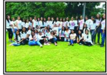
Group Day Celebration by AINS Students