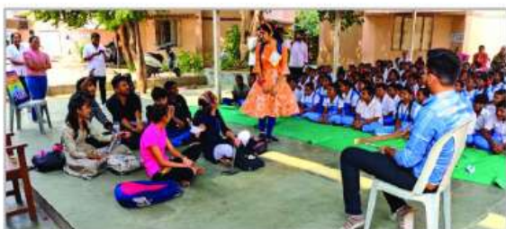
Children's Day Celebration at Primary School, Lapkaman, Ahmedabad