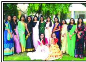
Traditional Day Celebration by AINS Students