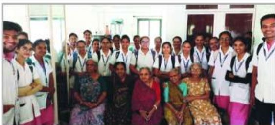
Educational Visit at "Avval Foundation" Old Age Home, Ghatlodiya, Ahmedabad