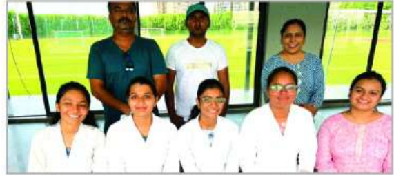
Educational Visit at Savvy Swaraaj, Gota, Ahmedabad