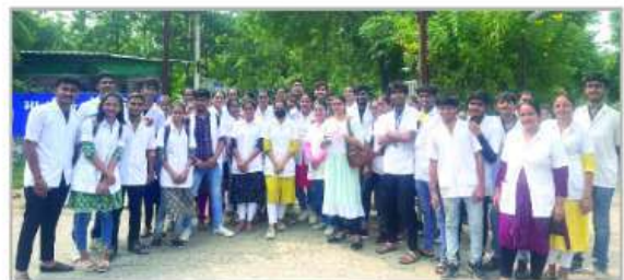
Educational Visit at Kanoria Hospital & Research Centre, Bhat, Ahmedabad